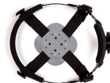
HPR441 – 4-point Ratchet Replacement Suspension