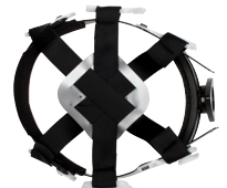
HPR461 – 6-point Ratchet Replacement Suspension