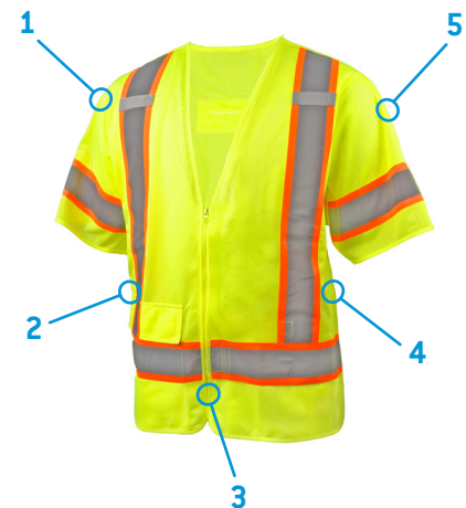
5 BREAKAWAY LOCATIONS

Tried and Tested: Meets ANSI/ISEA 107-2020 Type R Class 3 standards ensuring high visibility and safety