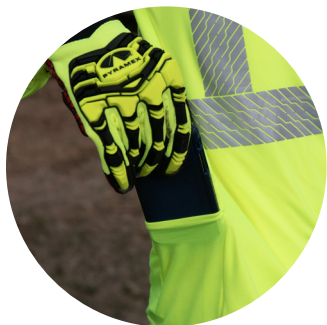
Cell phone pocket